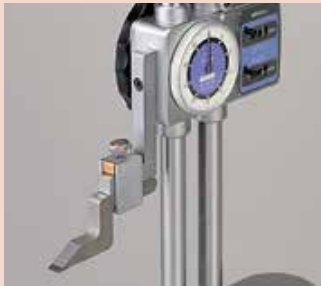
Easy and secure clamping