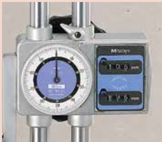
Easy and error free reading