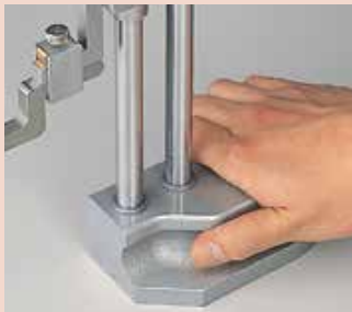
Comfortable grip base

953638: Holding bar for test indicator (length: 50mm) 900209: Holding bar for test indicator (length: 100mm) 953639: Holding bar for test indicator (length: 2") 900306: Holding bar for test indicator (length: 4") 900321: Swivel clamp used with holding bar (metric) 900322: Swivel clamp used with holding bar (inch)